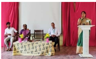
TRICKS IN PHOTOGRAPHY BUSINESS