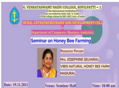
Honey Bee Farming