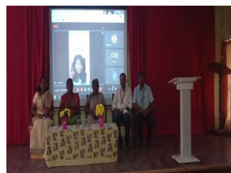
NUANCES OF ENTREPRENEURSHIP