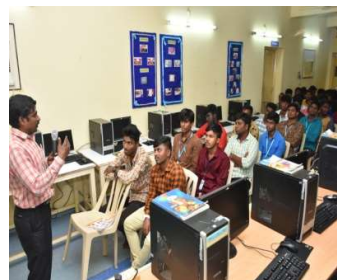
Entrepreneurship Opportunity in Mushroom Cultivation for Entrepreneurship Buddies