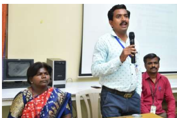
VERMICOMPOST – A PROFITABLE ENTREPRENEURSHIP