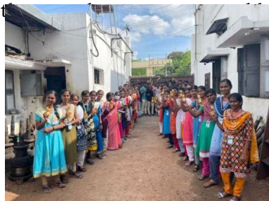
Industrial Visit to Resham Sesame Oil, Kovilbatti

The IQAC and EDC stimulate every student and make them more productive and become entrepreneurs. The cells break the comfort zone of the students and involve them in risk-taking activities and behave like an owner. Students learn more about handling daily business opportunities and connect