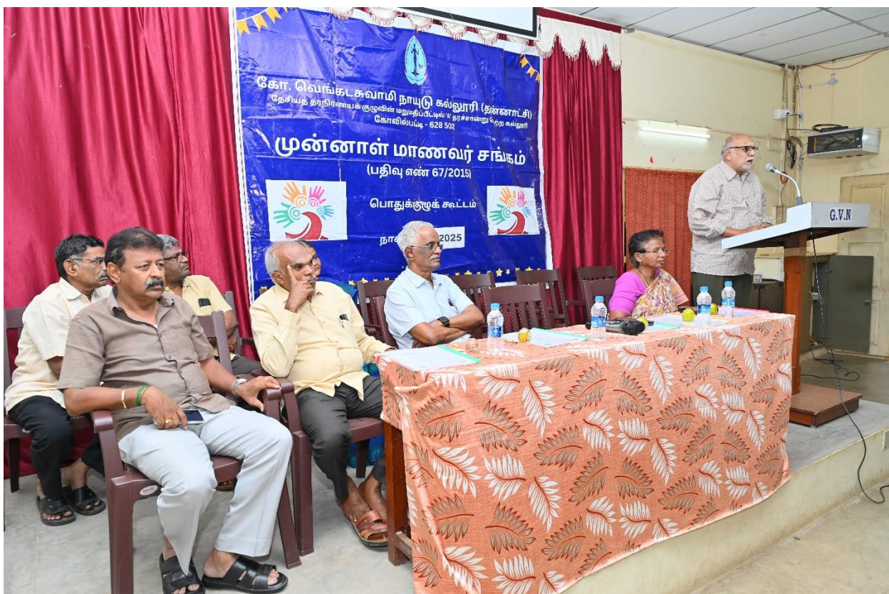
Alumni General Body Meeting organised on 10.09.2025