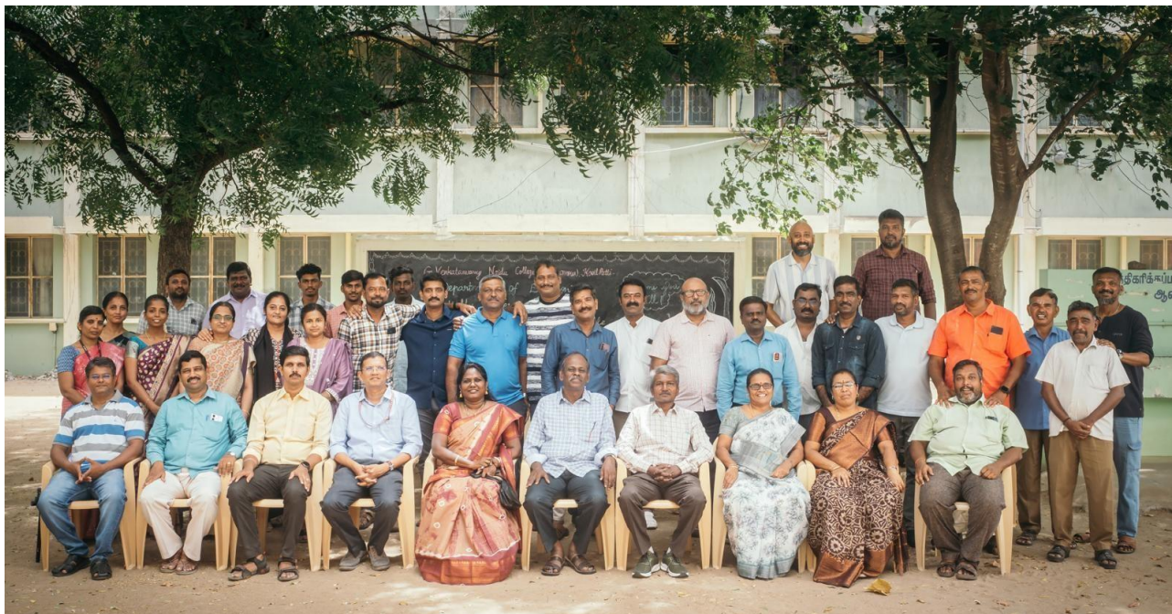
Silver Jubilee Reunion Meeting of 1997-2000 Electronics batch of students organised on 20.06.2025